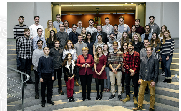
International students visiting Angela Merkel at the Chancellery Office in Berlin

Come to Greifswald – with the possibility to take part in a Summer School in German and an introductory week prior to your studies here.