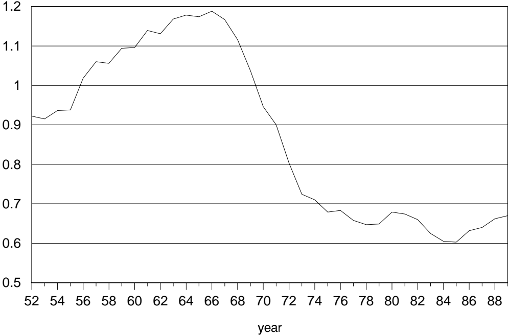
Figure 1: Net reproduction rate (NRR) 1952-1989

Source: Compiled and calculated from Statistisches Bundesamt [1994b].